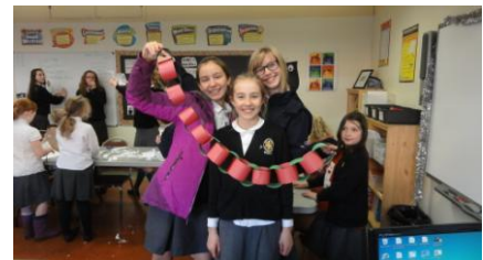
Christmas Crafts during CCCS Christmas Spirit Week