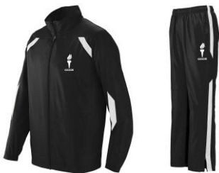
NEW Track Suit

GREAT NEWS! Better pricing on the CCCS Track Jacket & Pants Todd has worked with our supplier to find a new version of the CCCS track jacket and pants that still looks great, but at a significantly lower cost. The new version is from Augusta Sportswear (not Under Armour). There is a savings of approximately $20 per item! For those who have already placed an order, your payment will be returned and we will need a new cheque for the lower amount. All orders need to be in by Tuesday morning, November 1 st . Orders will arrive in 2 - 3 weeks after the order is placed. A NEW ORDER FORM is attached with this newsletter (and available in the office).